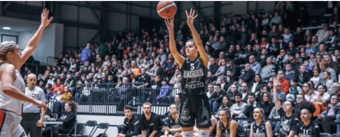
ANOTHER RECORD-BREAKING ATTENDANCE AT A WOMEN'S BRITISH BASKETBALL LEAGUE GAME