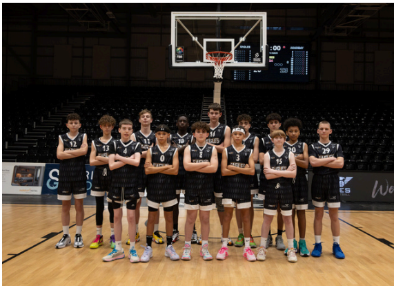
UNDER 14 BOYS