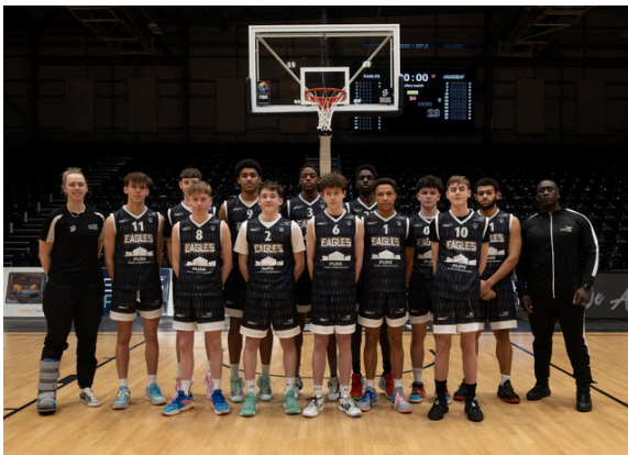
UNDER 16 BOYS