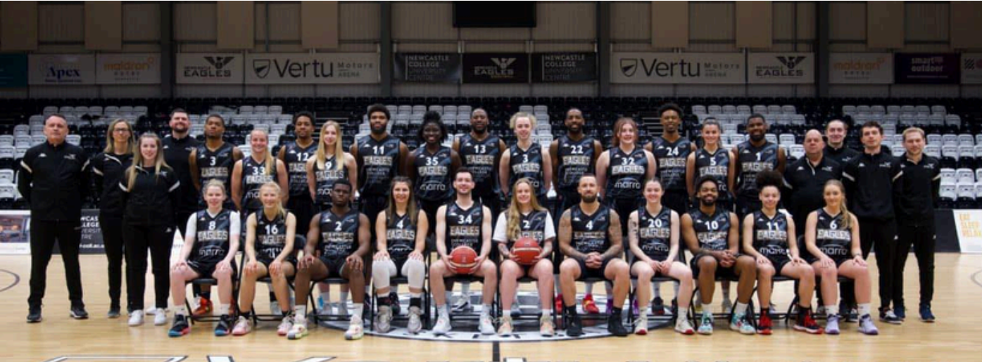
2022-23 NEWCASTLE EAGLES BBL & WBBL TEAMS