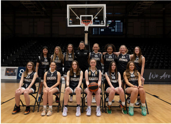
UNDER 14 GIRLS